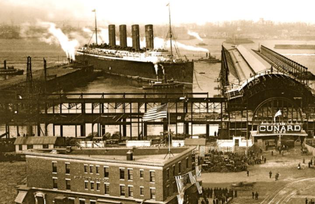
New York 1925, le pier 54 et le pier 97...