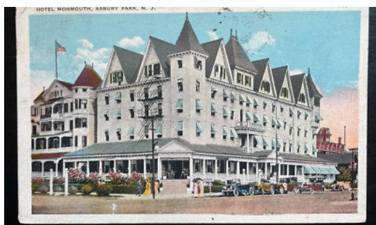
Asbury Park, le bord de mer dans les dimanches d'été, cartes postales 1925.